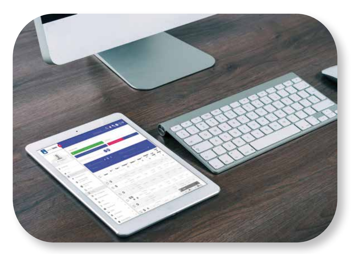
"Register in the ServiceDesk any request received from any input channel."

Manage tickets (incidents, requests, queries) with registration, prioritization, assignment, monitoring and control of changes until their closure.